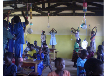
Kankwilimba Community School today