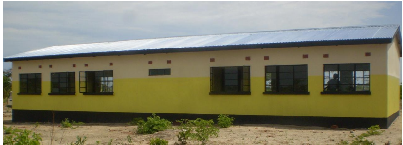
Anananga Community School today