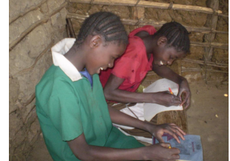
Nasiwi Community School,