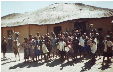
Original Kaye Community School ó external picture

In the Lukulu District, there are about 75 government funded schools, 25 community schools registered with the Ministry of Education and many more non-registered community schools. These rural community schools are housed in pole/mud/thatch structures with prized possessions being a blackboard and chalk and a handful of textbooks. Children have A5 exercise books and pencils but often little furniture. Some children do become literate and numerate and graduate from these community schools to main stream schools.