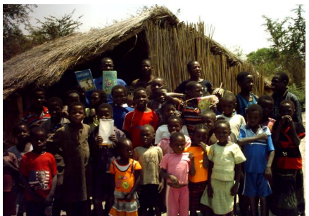
Original Wamba Community School ó external picture