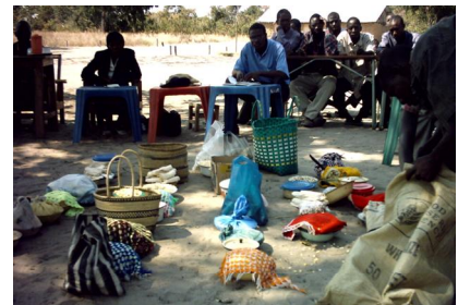
Teacher remuneration in kind at Kalambwe Community School. Parents contribute the fruits of the harvest.