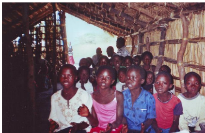
Original Wamba Community School ó interior picture