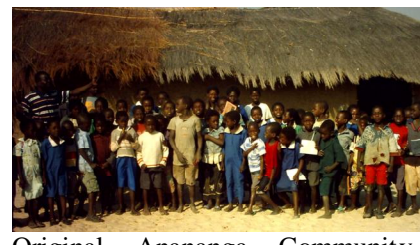
Original Anananga Community School