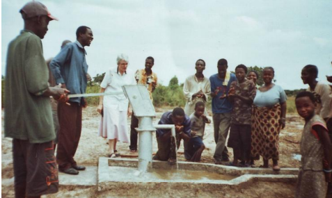
New pump at Kayeo Community School

During the last five years, Loreto has been involved with six rural community schools in the Lukulu District, working with the communities, teachers and education authorities. Through the generosity of many donors, large and small, these schools now have facilities that are more educationally functional, safer and healthier. Classrooms, furniture and educational materials provide for a better learning environment. Boreholes and VIP latrines make for better health. Teachers have not been forgotten and in some cases small two room houses have been built and main stream teacher training is being provided for some community school teachers. Loreto does not become involved in remuneration of the teachers as this is the responsibility of the communities if the schools are to be sustainable in the long term.