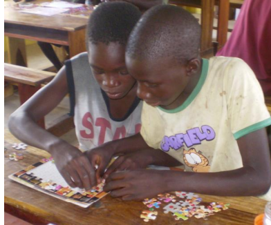
Kankwilimba Community School today